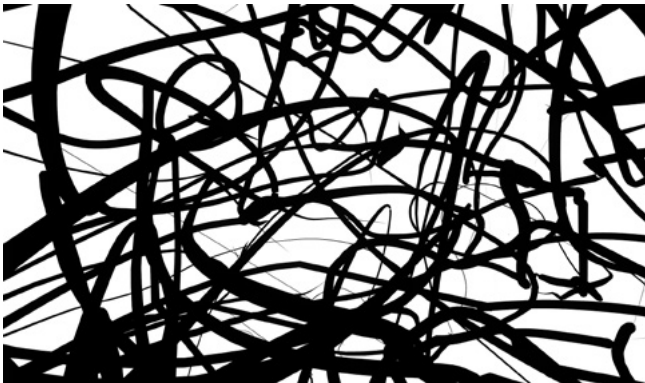
GIBSON / MARTELLI Drawing Levels virtual environment . 2018