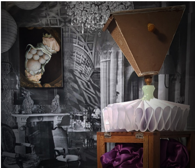
SASHA BOWLES Interior 2 . Mixed media. 2019